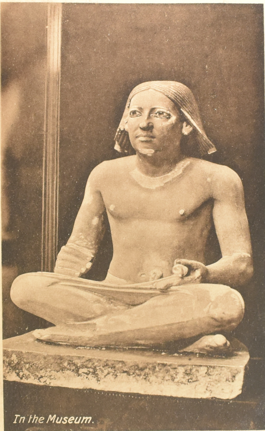
In the Museum.