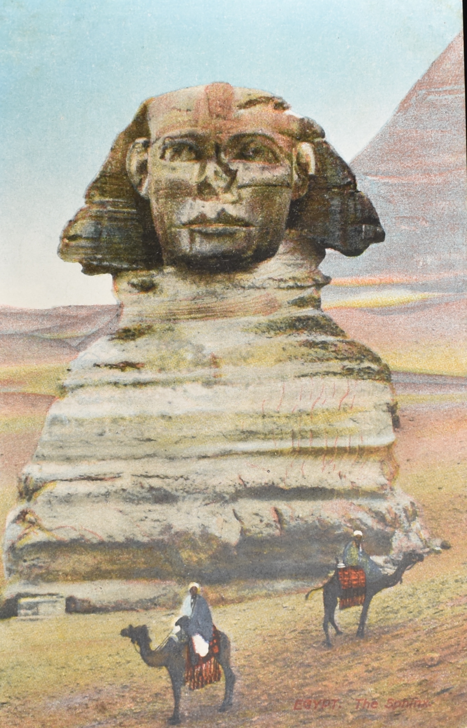
EGYPT. The Sphinx