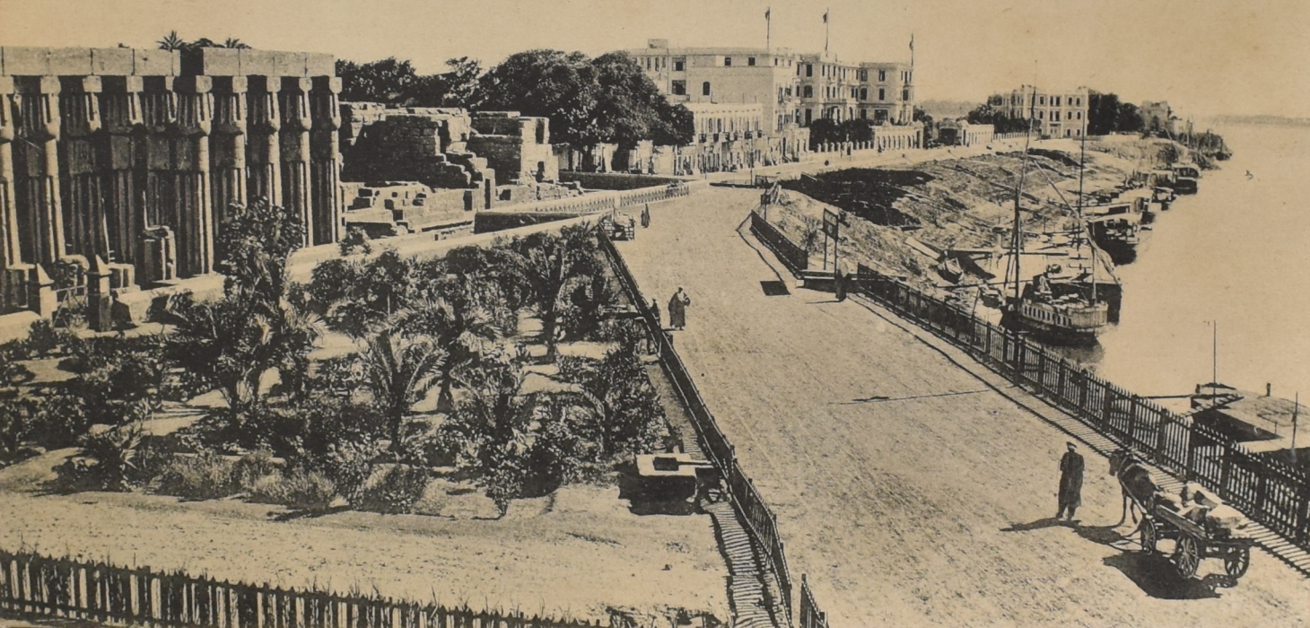
LUXOR - The quay street.