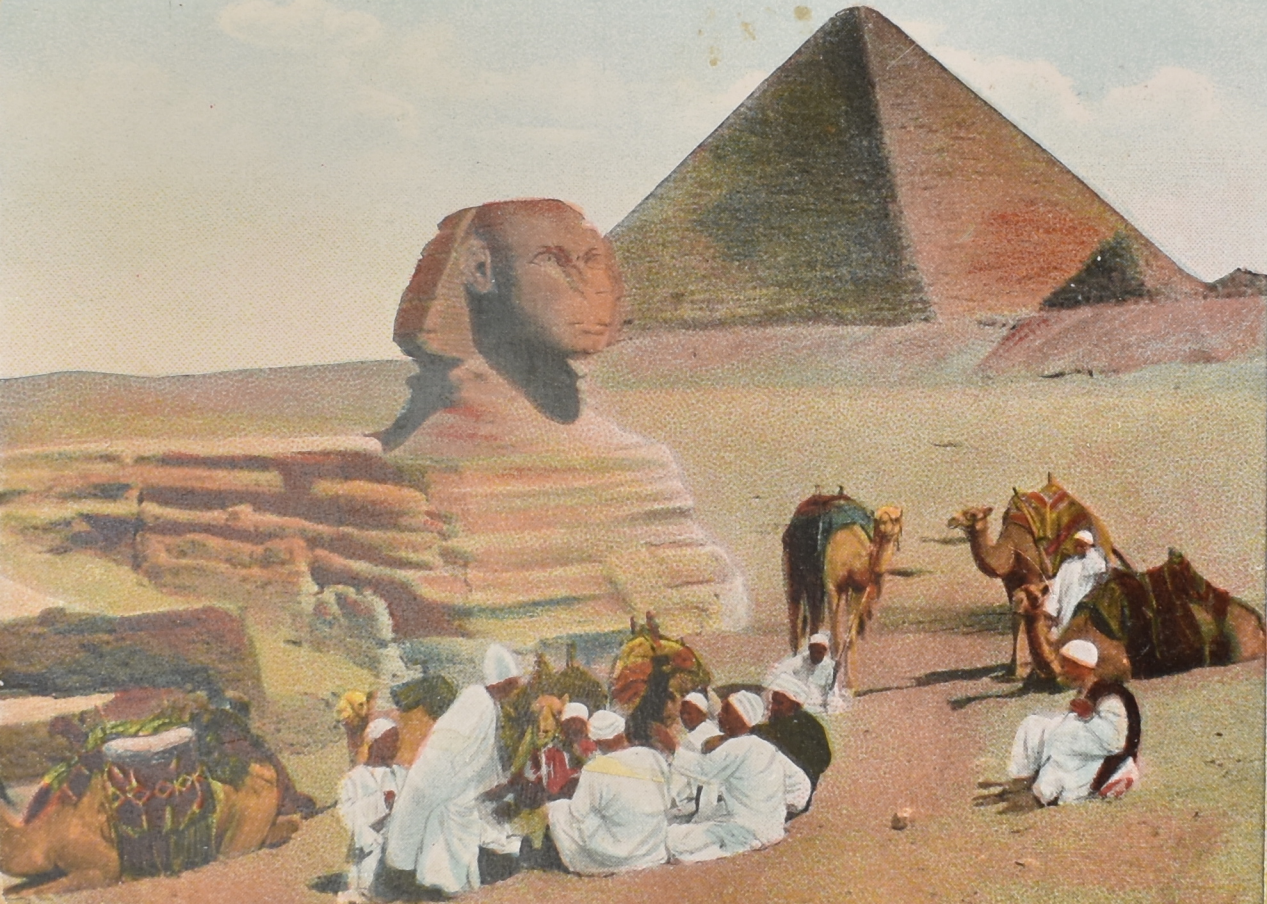
PYRAMID AND SPHYNX.