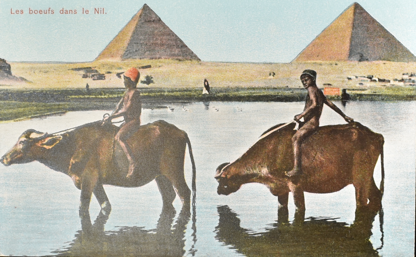
Les boeufs dans le Nil.