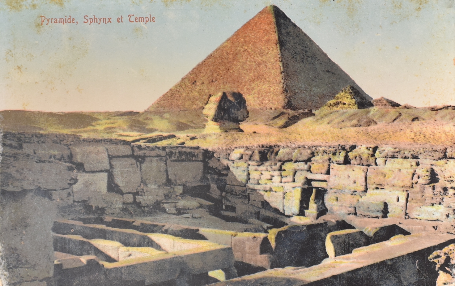
Pyramide, Sphinx et Temple